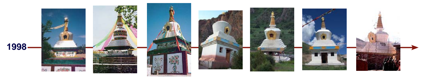
Construction begins on the first of seven stupas to be built: three border stupas in Amdo, two at Kala Rongo, one at Korche and one in the city of Shornda.