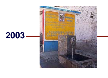
NYEMA, along with the Gracious Glory Buddhism Foundation and Water for Humanity, provide running water to Korche Monastery.