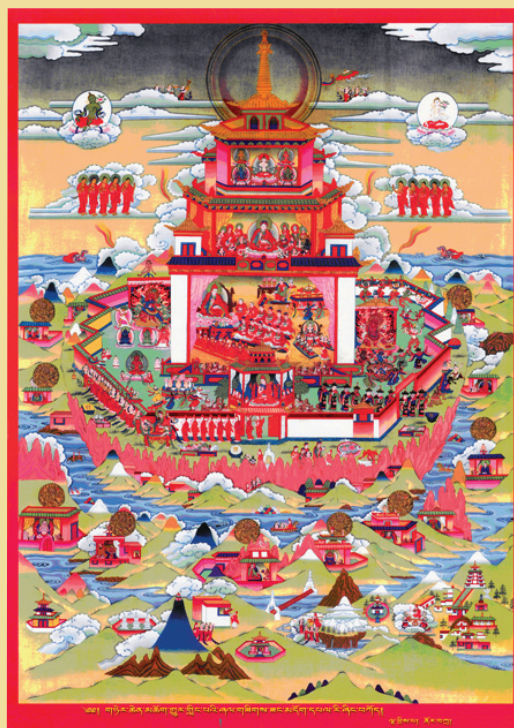
Artist's Depiction of the Zang Dok Pal Ri Palace